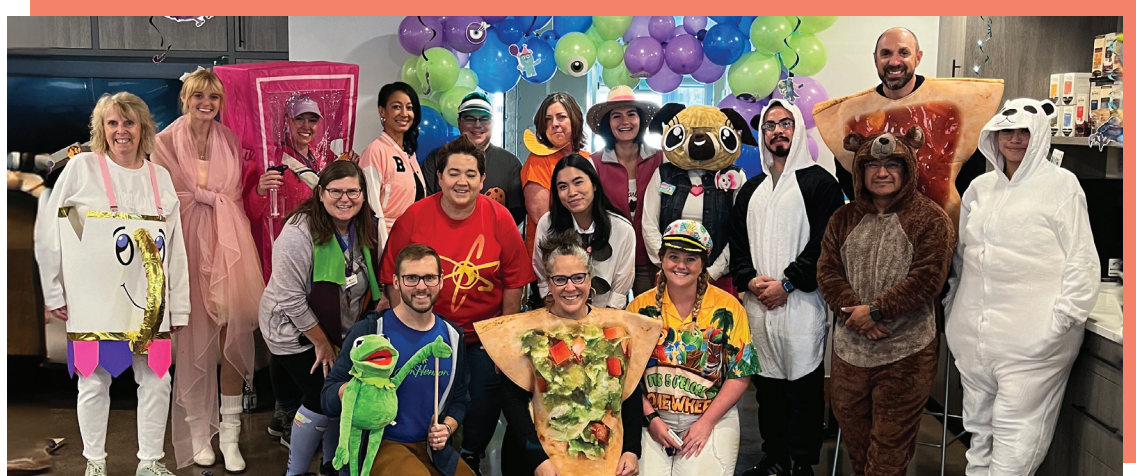
To maintain a sense of normalcy for residents, our team goes great lengths to spark joy, Halloween is no exception!